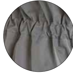
Elastical back waist.