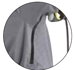
Openable ventilation in the armpits.