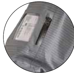
Pocket for ID card on the right sleeve.