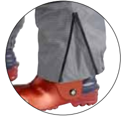
Zippers at the bottom of the legs.