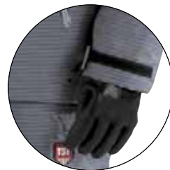
Cuffs adjustable with Velcro.