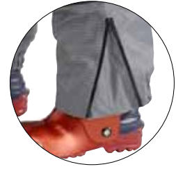
Zippers down on the legs.