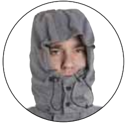
Detachable hood with 3 adjustment possibilities and room for hearing protection.