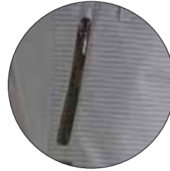
2 pockets with water-proof zippers.