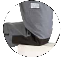
Reinforcements on the knees.