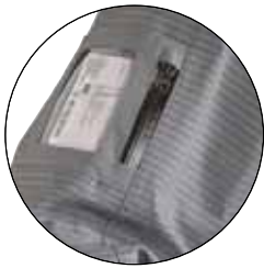
Pocket for ID card on the right sleeve.