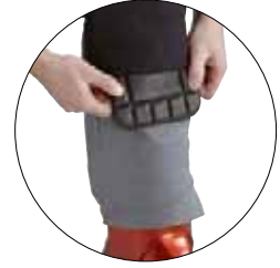
Pockets for knee pads.