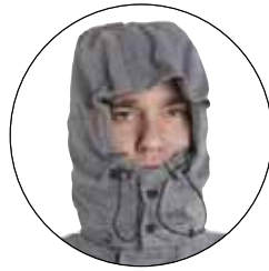
Detachable hood with 3 adjustment possibilities and room for hearing protection.