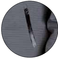
2 pockets with water - proof zippers.