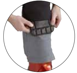
Pockets for knee pads.