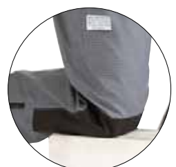
Reinforcements on the knees.