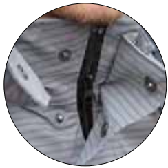
Waterproof zippers with overlapping flap.