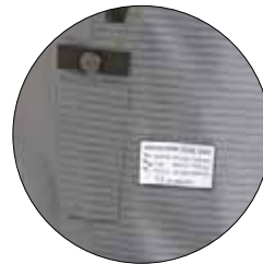
Knife pocket on right leg.