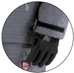
Cuffs adjustable with Velcro.