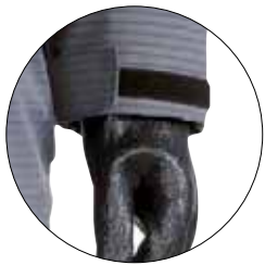
Comfortable inside arm cuffs prevent leakage.