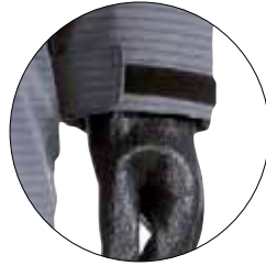
Comfortable inside arm cuffs prevent leakage.