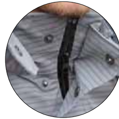
Waterproof zippers with overlapping flap.