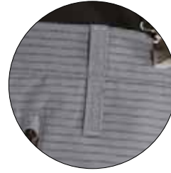
Double belt loops.